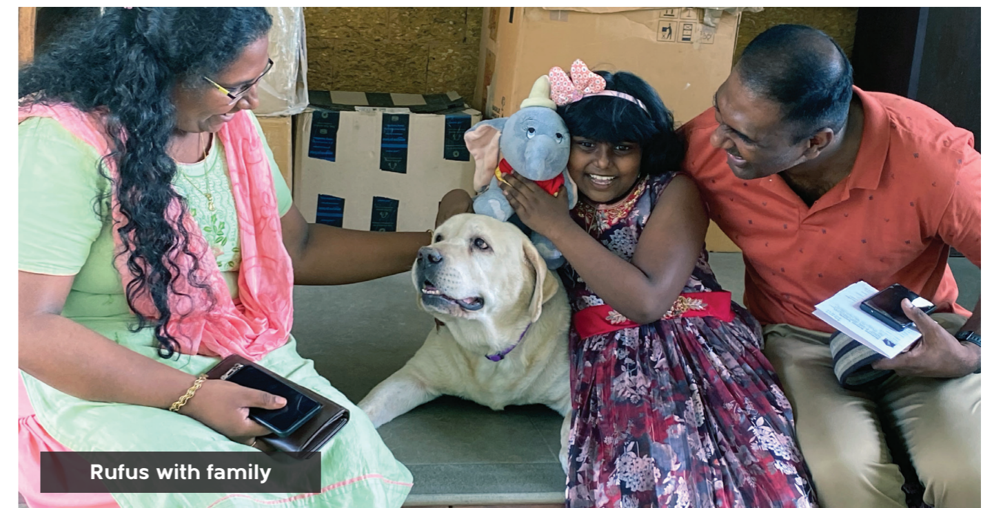
Rufus with family