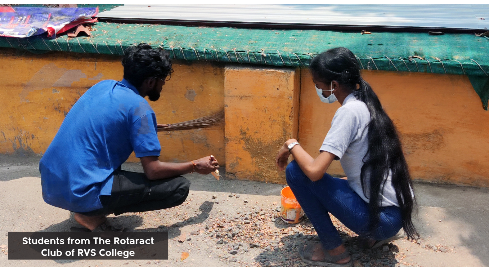
Students from The Rotaract Club of RVS College