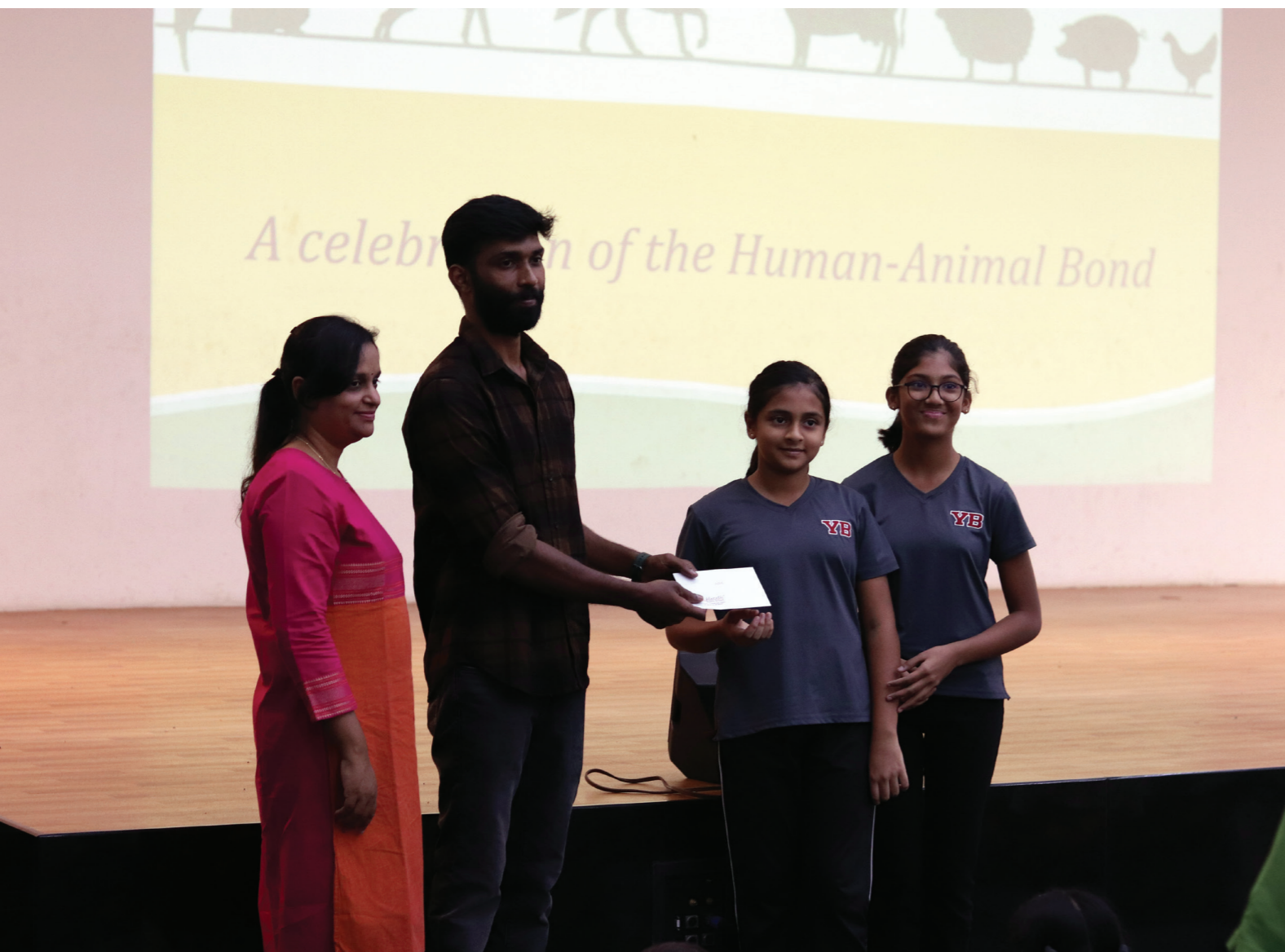
Students from Sri Krishna College of Technology's 'BeLove' campaign